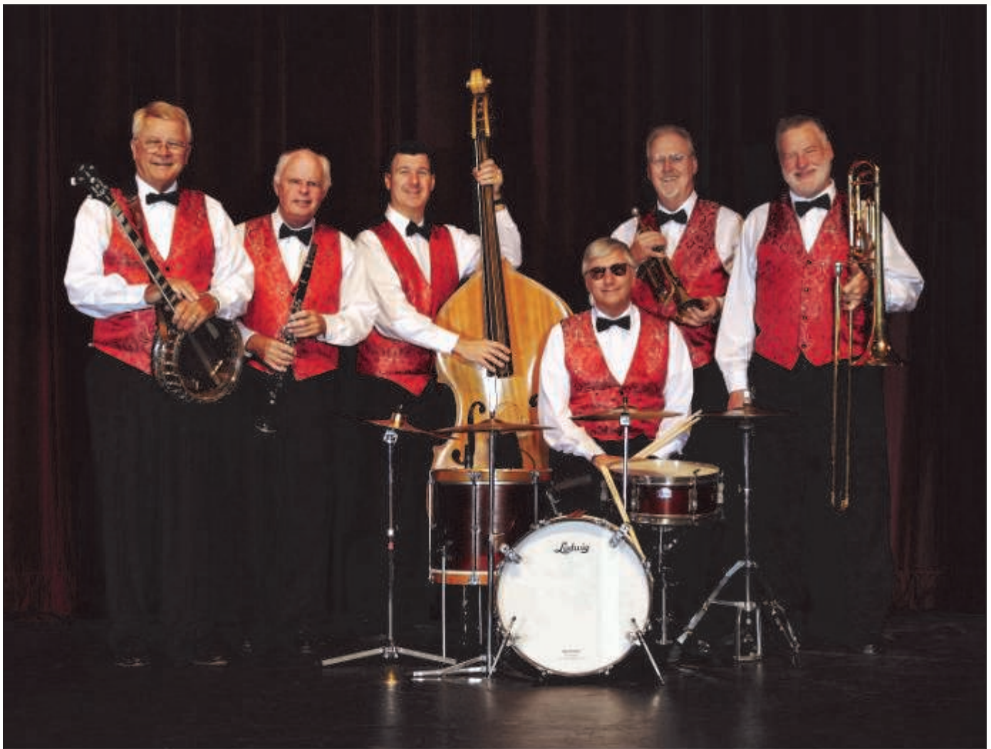
BARBARY COAST DIXIELAND SHOW BAND

Don't miss the opportunity to enjoy the music of Barbary Coast Dixieland Band and help care for the hungry on Souper Music Sunday, January 25 th !