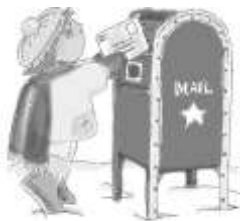
Packages for the Military

MILITARY ADDRESSES are needed to send these boxes