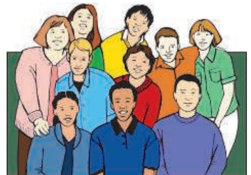
Monday Night Fellowship